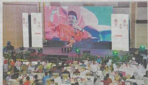
Tazkirah Ramadan antara pengisian pada majlis Iftar berkenaan.