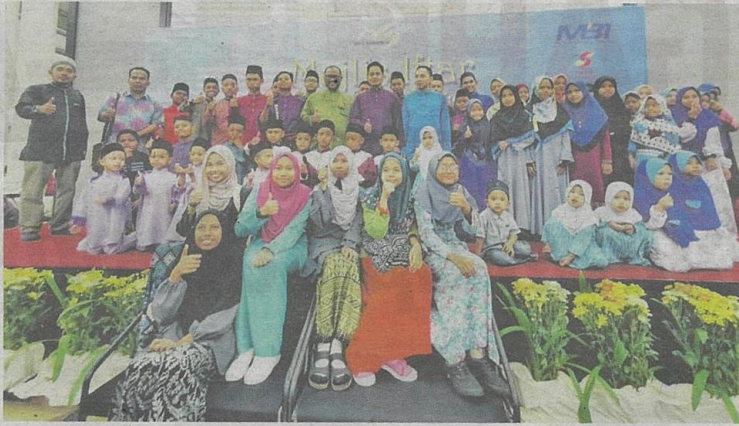
Kira-kira 80 anak-anak yatim dan asnaf diraikan pada Majlis Iftar KDEB Waste Management kelmarin.

"Ada sebahagian kawasan PBT yang meningkat 20 hingga 30 peratus. Sebagai contoh di Klang, sebelum bulan puasa kita ambil 750 tan sehari tetapi dalam bulan puasa terdapat tambahan 20 peratus lagi. Untuk keseluruhan Selangor, kita kutip 5,200 tan sampah sehari iaitu berlaku pening-