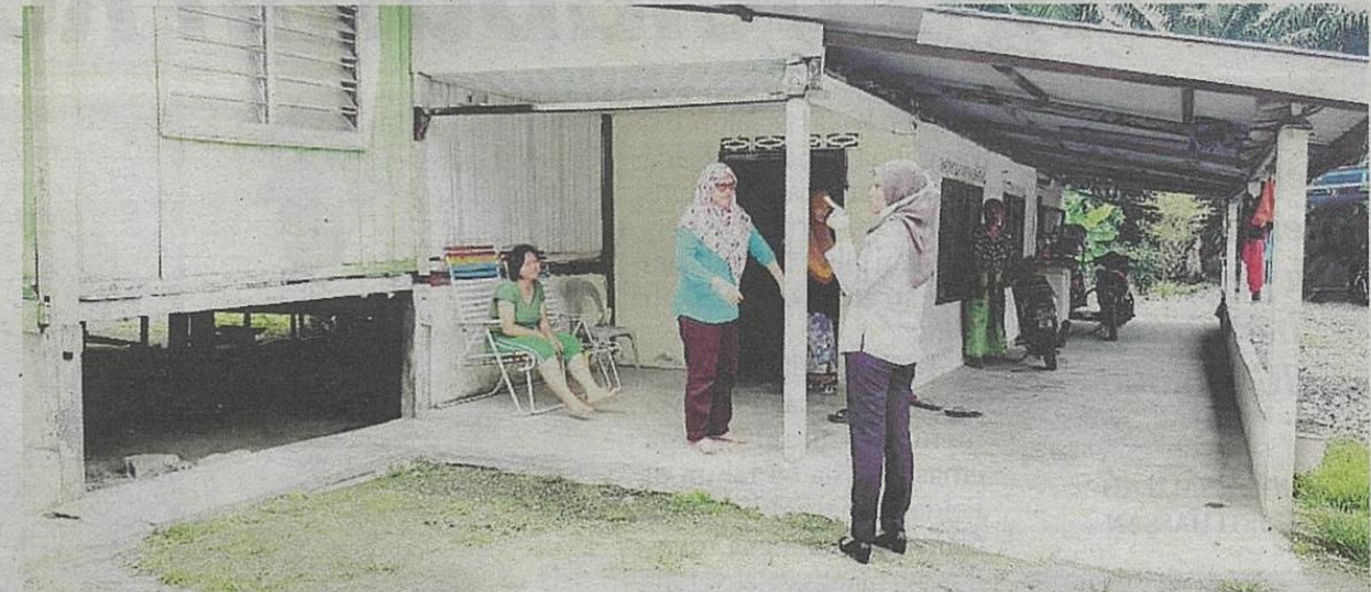
Pegawai Jabatan Kesihatan MDKS memantau rumah penduduk berikutan aduan gangguan lalat di Kampung Parit Mahang.

KUALA SELANGOR - Majlis Daerah Kuala Selangor (MDKS) masih menyiasat punca gangguan lalat di empat kawasan terjejas di Kampung Parit Mahang.