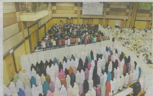
Anggota PKNS serta tetamu yang hadir solat isyak dan tarawih berjemaah.