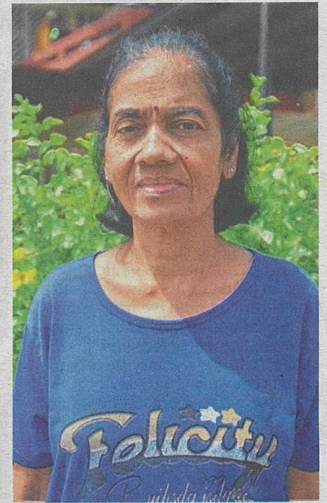
Lakshmi says scrap metal thieves have ripped out loose hoardings.

"Creepers are growing over the hoardings, and we want the developer to clean up the place," she said.